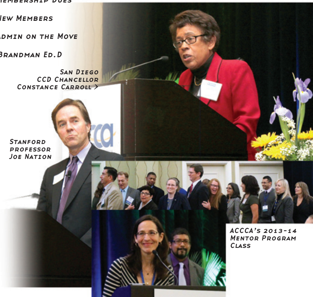
ACCCA'S 2013-14 MENTOR PROGRAM CLASS