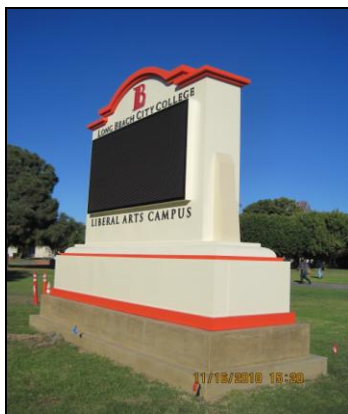
Electronic Marquee at LAC