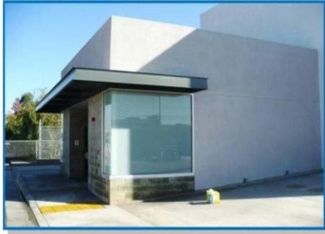
Central Plant at PCC