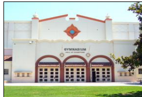
Large Gym Façade Renovations at LAC