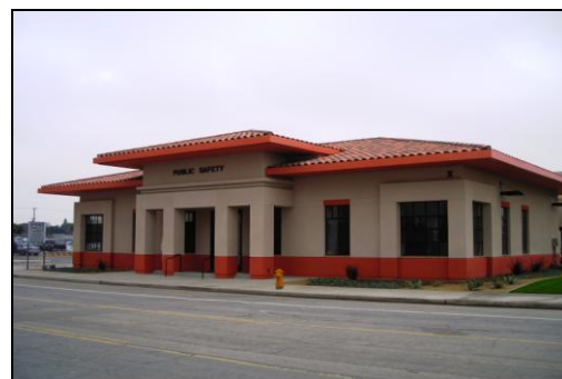
Central Plant at LAC