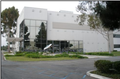
Building O1 at LAC