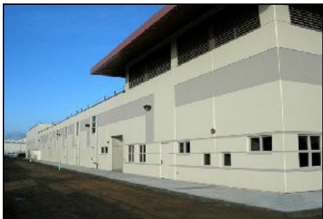
District Facilities & Warehouse at LAC