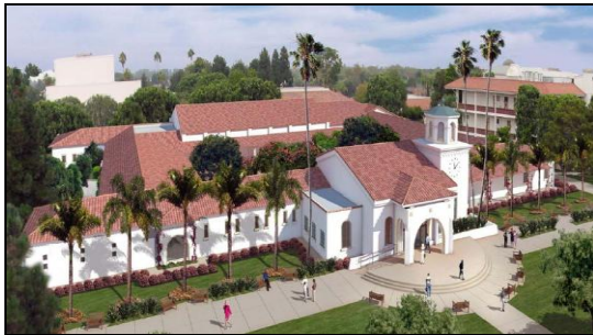
Building A Student Services Retrofit at LAC

Multi-Disciplinary Academic Building at PCC – Construction started Summer 2010