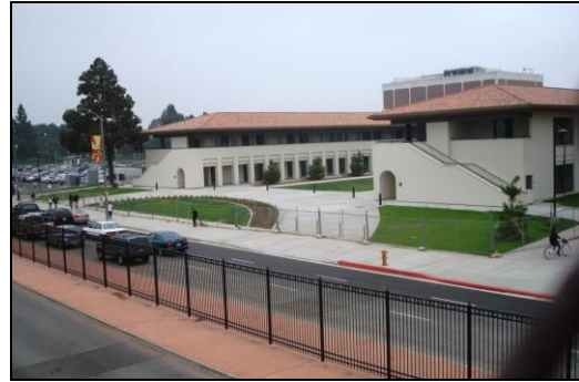
South Quad Complex at LAC