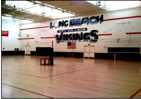
Small Gym Renovations at LAC