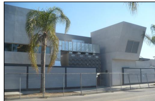
Industrial Technology Center at PCC