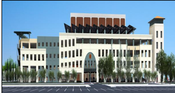
Parking Structure in Lot J at LAC