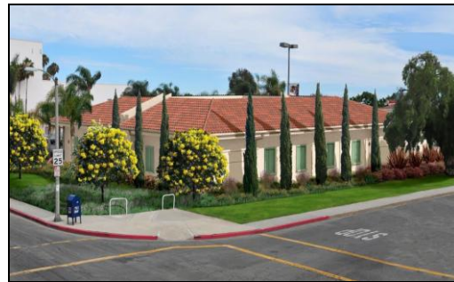
Building I Bookstore Retrofit at LAC