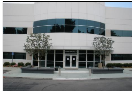
Building O2 at LAC