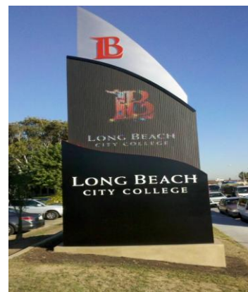
Electronic Marquee at PCC