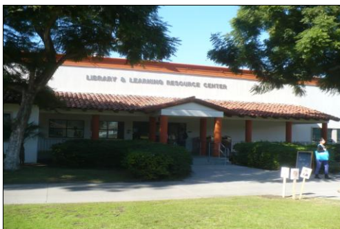
Learning Resources Center at LAC