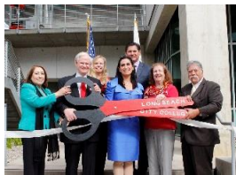
Ribbon Cutting Ceremony for PCC Building GG Student Support Services Building February 17, 2016