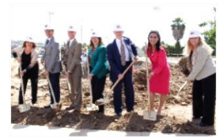
Groundbreaking Ceremony for PCC Buildings QQ & RR Electrical Program/Lifetime Learning Center April 27, 2016