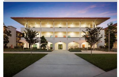
Building C at LAC