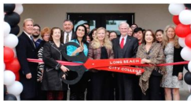
Ribbon Cutting Ceremony for LAC Building C Nursing Program March 14, 2016